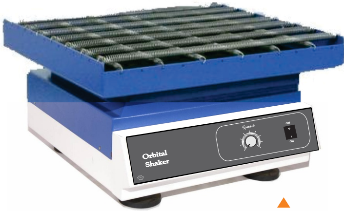
BVS - OS1

If you need a specific solution (Heavy Duty Large Volume Mixing) and OEM builds, Biovision Services has the ability to manufacture the solution.