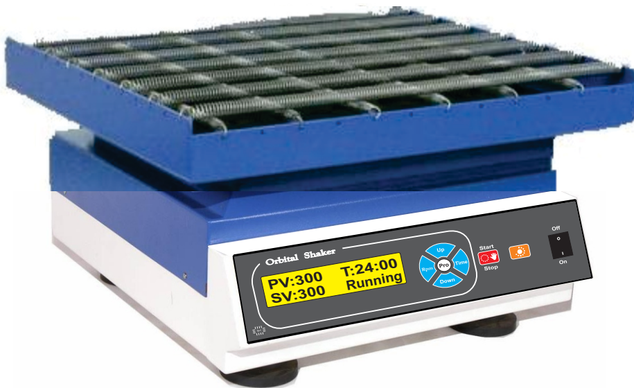
BVS - OS3